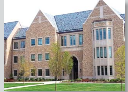
Figure 1: University of Notre Dame, McCourtney Hall.

The first building in this new East Campus Research Complex was designated "McCourtney Hall of Molecular Science and Engineering." The name brings science and engineering together, and the reference to "molecular science," which occurs at the boundary between biology and chemistry, indicates the range of disciplines that would