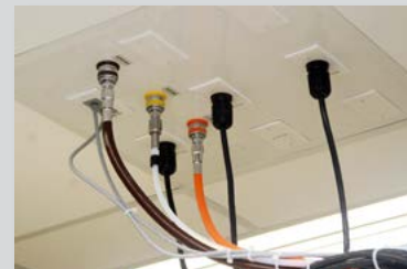
Figure 4: Vacuum network tubing (white) plumbed through ceiling tile.