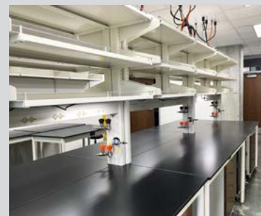
Figure 5: Local vacuum network ports mounted to casework