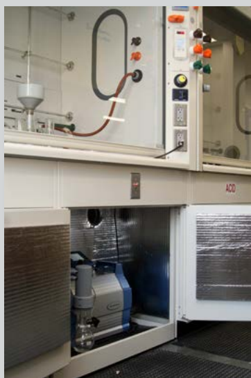
Figure 2: Local vacuum network pump under a fume hood.

Beyond the comparable capital costs and the improved flexibility, the local vacuum approach