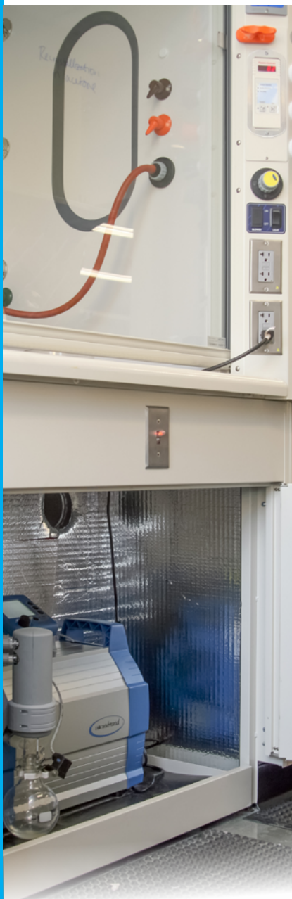
Local vacuum network pump under a fume hood.

So besides the adaptability that was the main reason for the use of local vacuum networks, the energy use over the life of the building is expected to be much lower than if a central system had been installed.